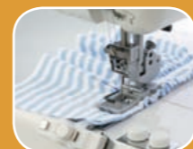
Elastic Gathering Attachment