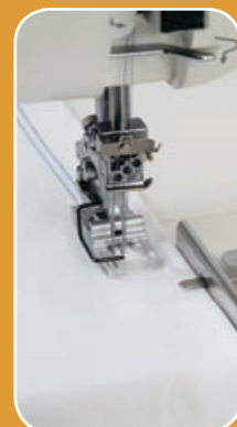
Clear View Cover Stitch Foot