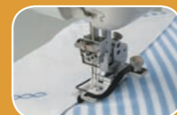
Center Guide Foot